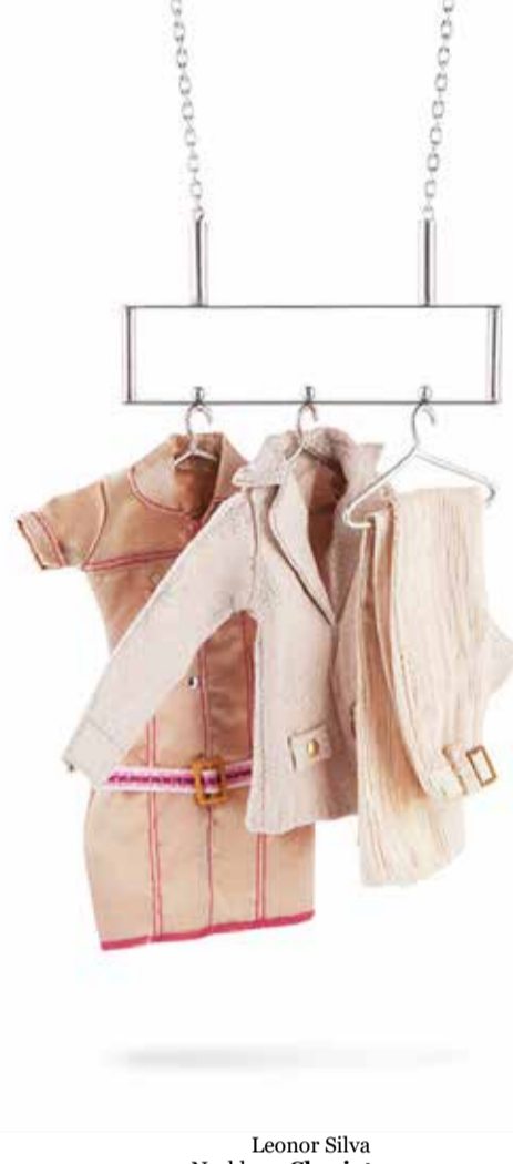
Leonor Silva Necklace: Chariot , 2019 Sterling silver, doll dresses. 10 x 14 cm