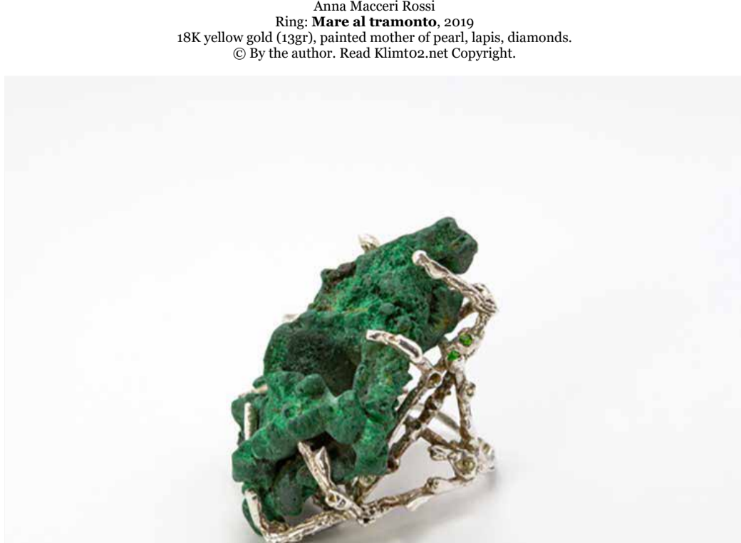
Diana Vas Ring: Beginning , 2019 Silver, rough malachite, green diopside.