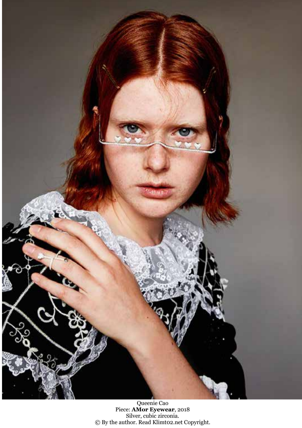
Queenie Cao Piece: AMor Eyewear , 2018 Silver, cubic zirconia.

© By the author. Read Klimt02.net Copyright.