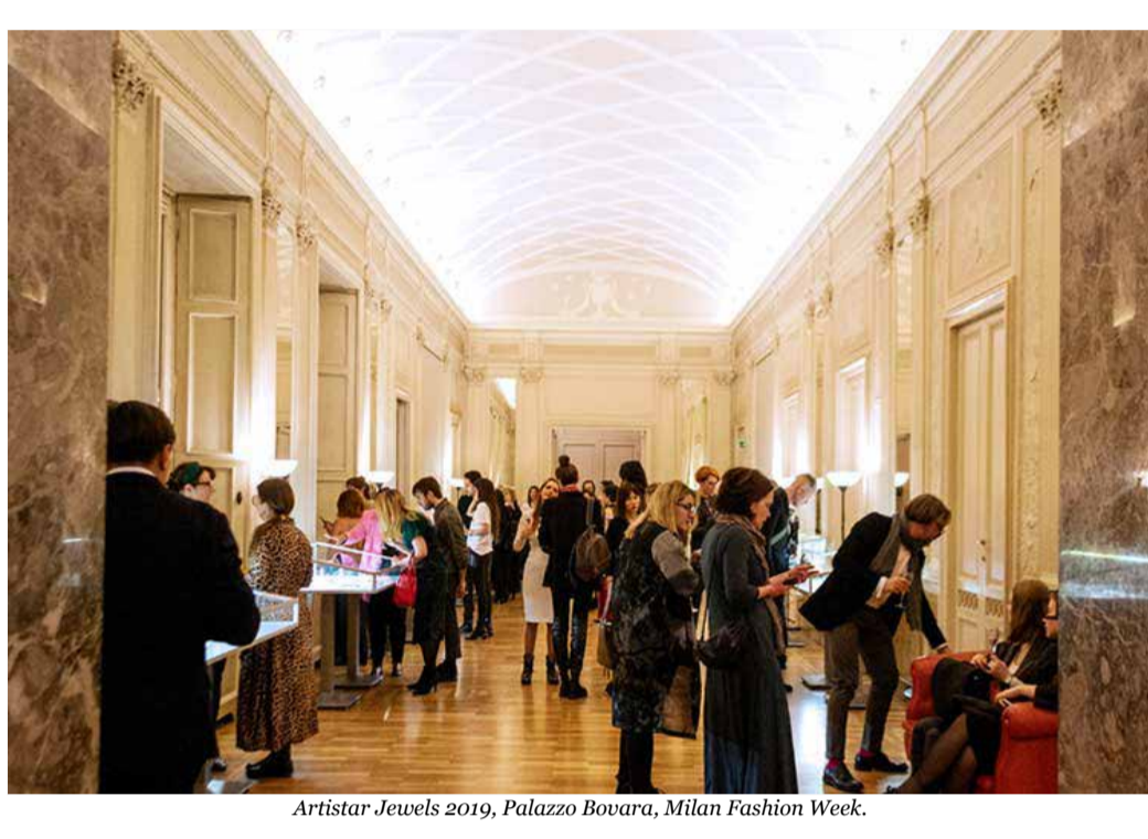
Artistar Jewels 2019, Palazzo Bovara, Milan Fashion Week.

The week is supported by the Municipality of Milan through the Patronage of the Assessorato Economia Urbana e Lavoro Unità Moda, Design e Creatività, will be unveiled at the press conference to be held on Wednesday 2 October at 11 am at the Sala Commissioni at Palazzo Marino.