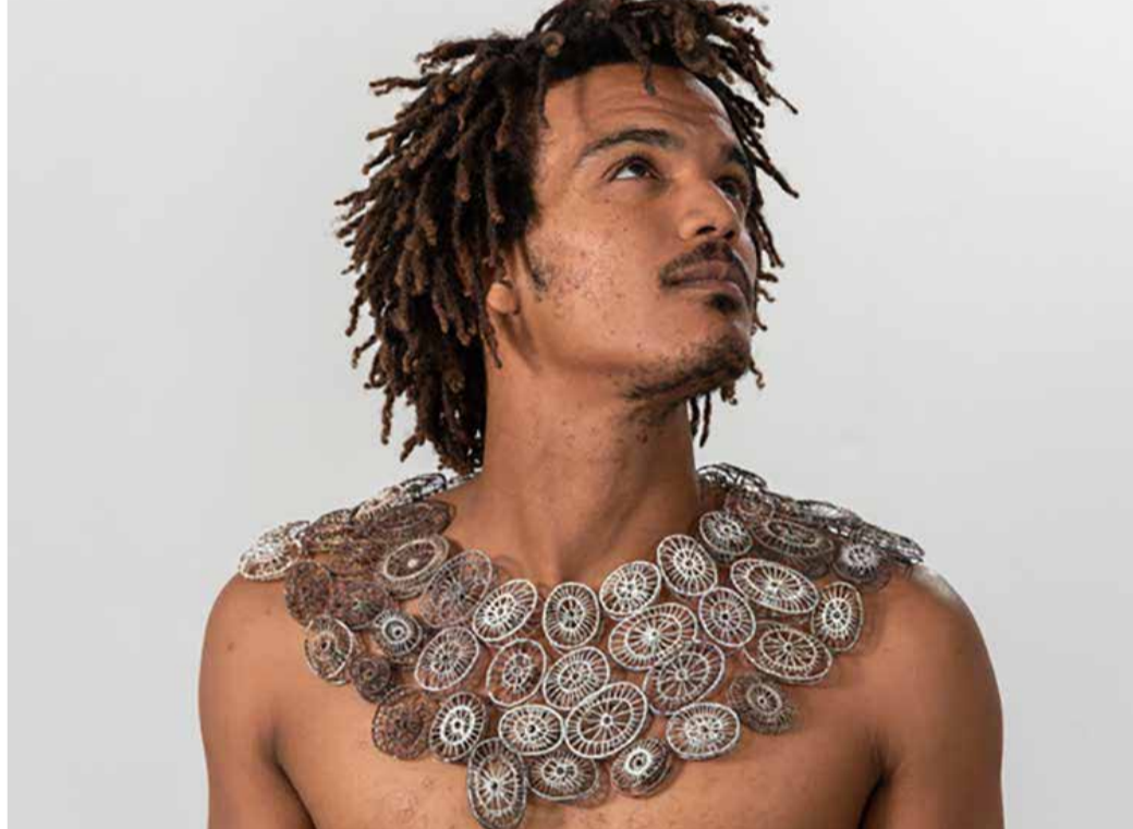
Eden Gedz Necklace: A Messy Flower , 2019 Copper, silver, enamel.