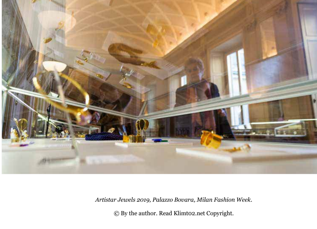
Artistar Jewels 2019, Palazzo Bovara, Milan Fashion Week.