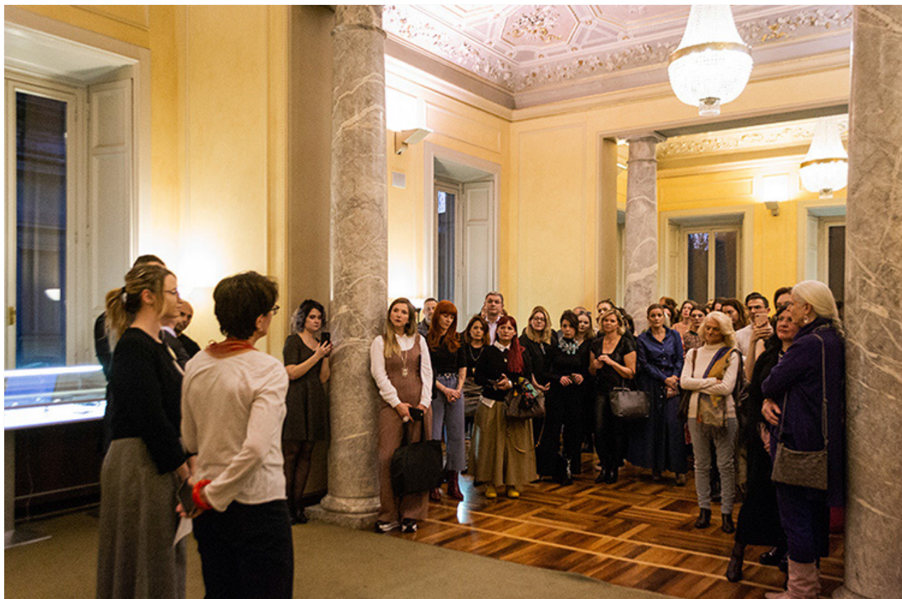
Artistar Jewels 2019 Artist Night, Palazzo Bovara.