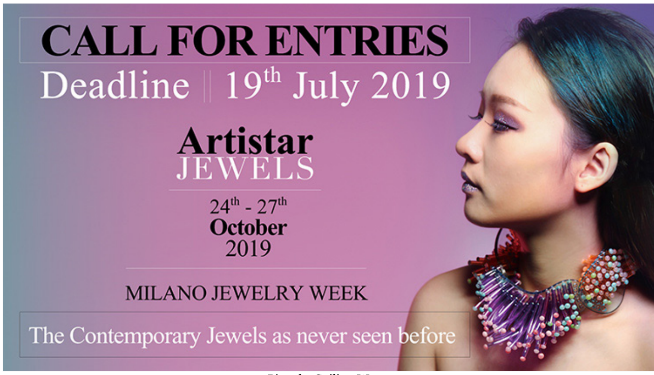
Piece by Suiling Wang.