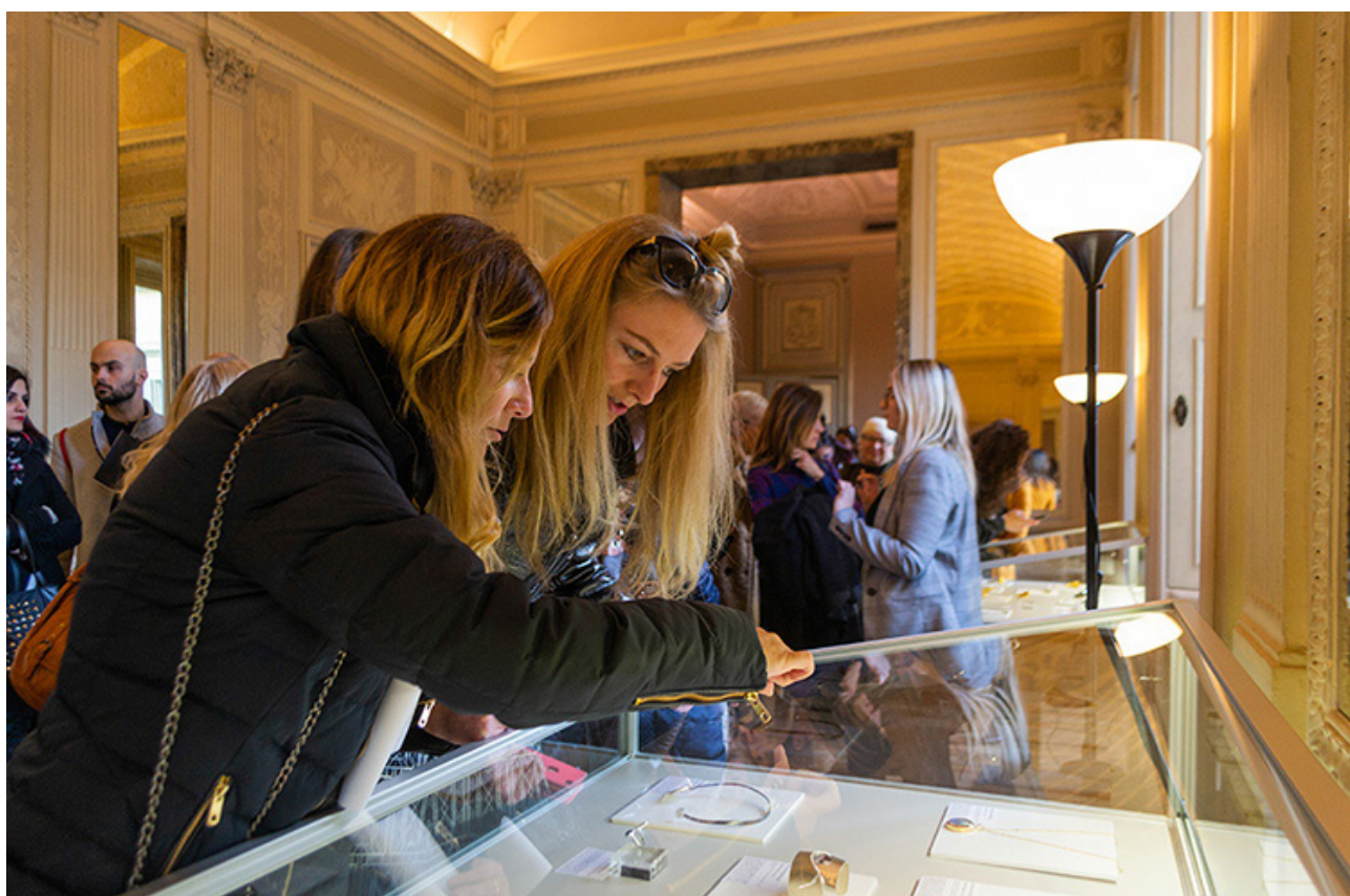
Artistar Jewels 2019 Press Tour.