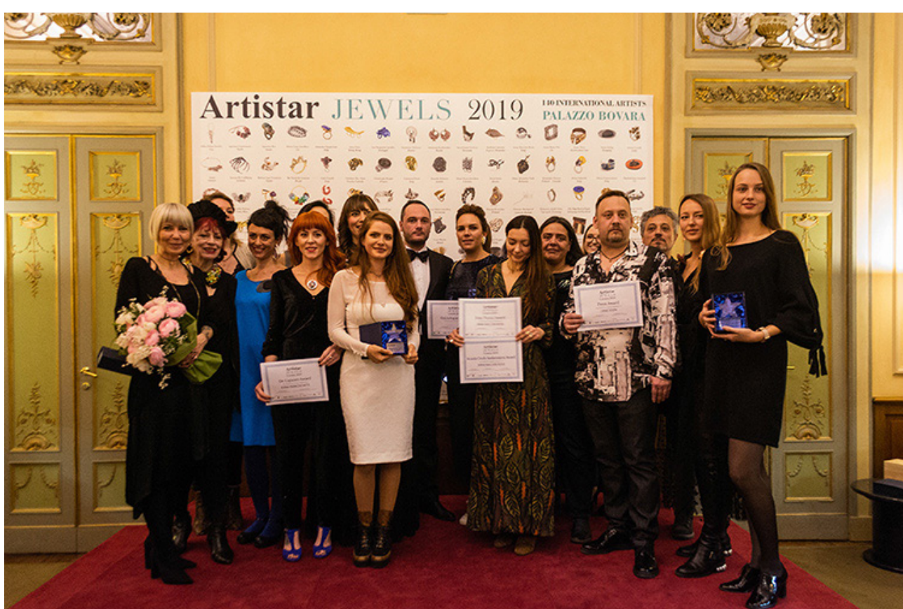
Artistar Jewels 2019 Winners.