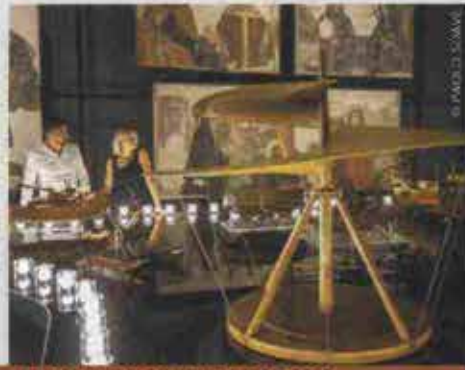
LEONARDO DA VINCI PARADE

LEONARDO DA VINCI 3D. IMMERSIVE INTERACTIVE EXHIBITION at Fabbrica del Vapore ➤ Until 22 September