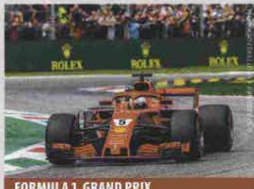
FORMULA 1 GRAND PRIX

REMAINS at Pirelli HangarBicocca ➤ Until 15 September MILANO