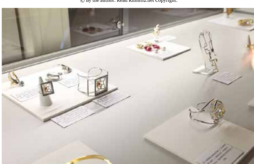
Artistar Jewels 2018, display window.