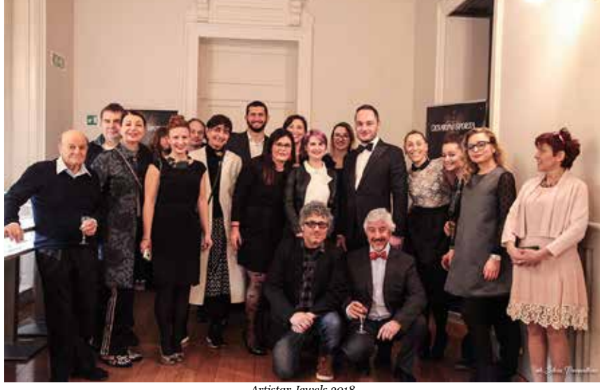
Artistar Jewels 2018.

© By the author. Read Klimtoz.net Copyright.