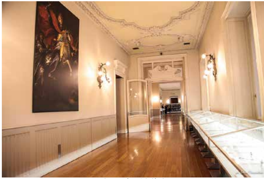
Artistar Jewels 2018, inside view.

A jury of experts will select 10 artists who will win important prizes and awards. All the selected creations will be protagonists of a dedicated shooting and published in the special volume Artistar Jewels 2019. The book, published by the publishing house Logo Fausto Lupetti, will be available on a national and international network: all bookshops in Italy and in the main European capitals, and shipped to over 5,000 industry insiders.