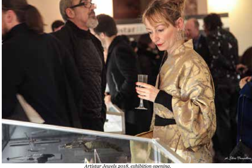
Artistar Jewels 2018, exhibition opening.

© By the author. Read Klimtoz.net Copyright.