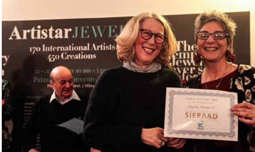
Artistar Jewels 2018, Sieraad Award.

© By the author. Read Klimtoz.net Copyright.