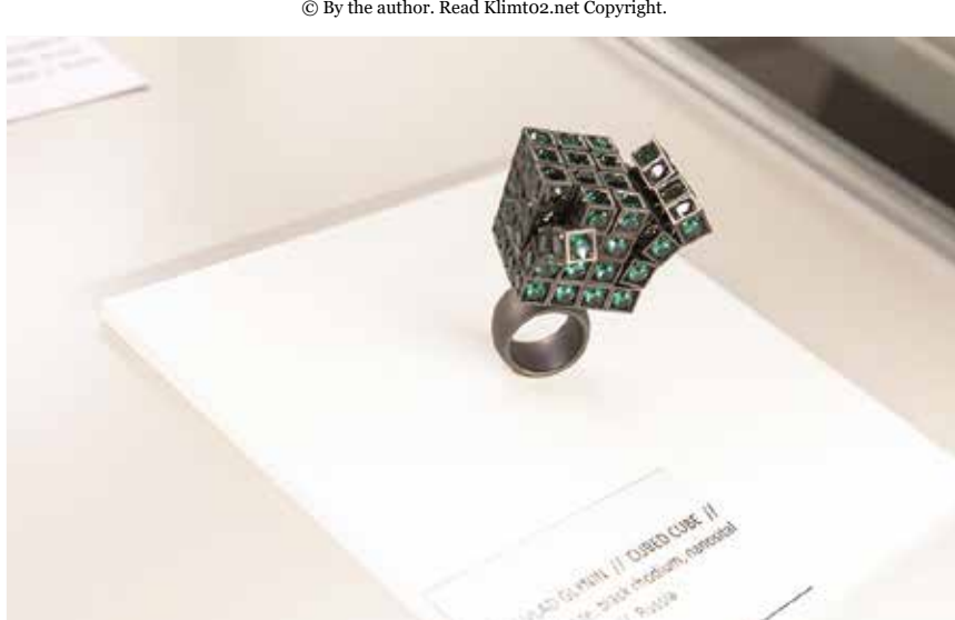
Vlad Glynn Ring: Cubed Cube , 2018 Bronze, black rhodium, nanosital. © By the author. Read Klimtoz.net Copyright.

© By the author. Read Klimtoz.net Copyright.