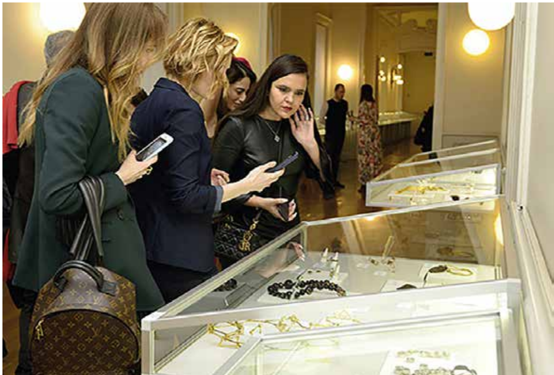
Stunned by style

A rtistar Jewels: is an event sure to dazzle with its brilliance and delight with its conception. It offers, every year on the international scene, an unprecedented reading on contemporary jewellery, which has been produced using both ancient and modern techniques; from lost wax, to 3D printing.