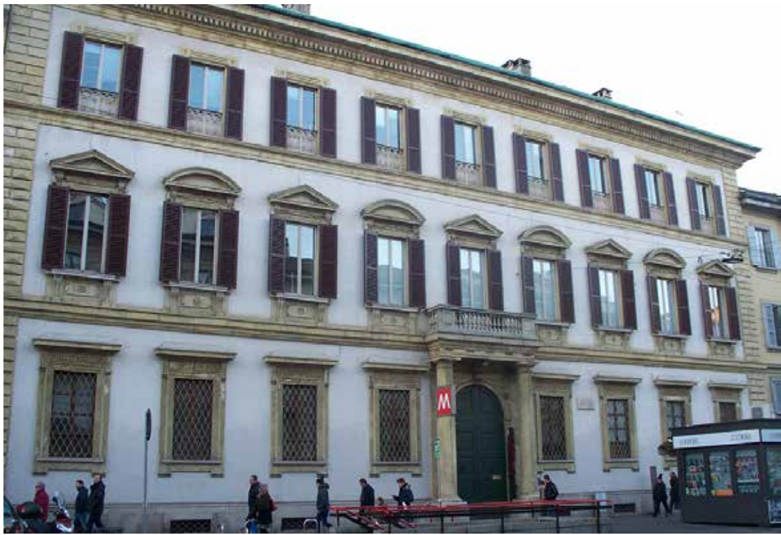
Palazzo Bovara, Milan