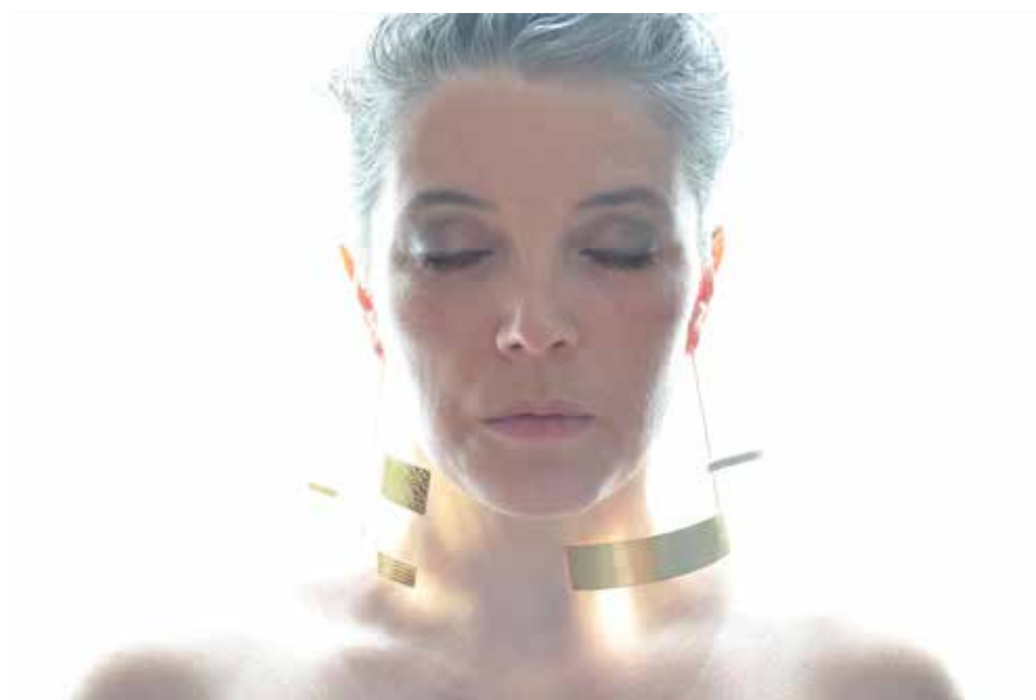
Helene Jeandot Earrings: Giraffe , 2017 Part of: Camera Lucida Contest

The project started at Romanian Design Week 2017 through the ROOM 40 - Deciphering contemporary jewelry design exhibition, and during September 13 - 30, 2017, it was presented at MNIR - The National Museum of Romanian History. A curatorial selection of Romanian designers was also presented during Joya Barcelona 2017 part of Assamblage Collective.