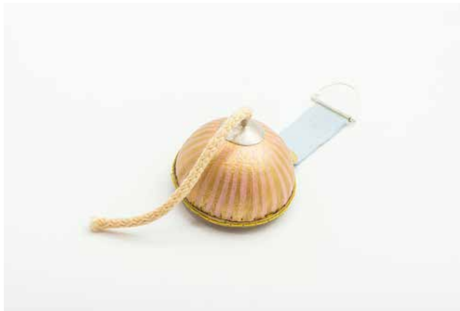
Angela Malhües Brooch: From here you will drink... , 2017 Model and painted leather, cotton tape, cord, varnished brass and sterling silver Part of: Camera Lucida Contest