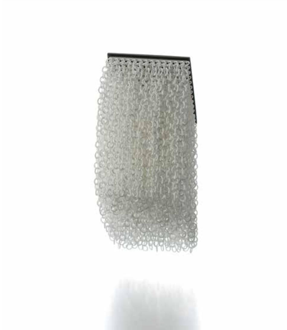
Ryungjae Jung Brooch: Motion , 2017 Part of: Camera Lucida Contest

© By the author. Read Klimto2.net Copyright.