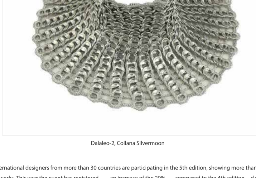
Dalaleo-2, Collana Silvermoon

Artistar Jewels is an event that gives an international and original perspective on the contemporary jewelry world, showing us the latest trends. The creatives will show their artworks, unique pieces or small series, selected according to their artistic value, technical testing & stylistic research. All the pieces are going to be sold on our website www.artistarsewels.com starting from next February, and the platform will be even more contemporary thanks to an accurate restyling.