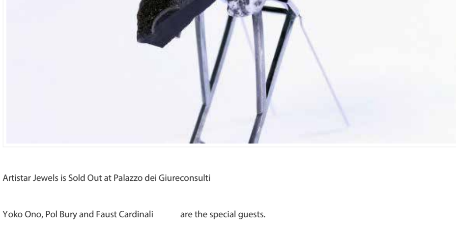
Artistar Jewels is Sold Out at Palazzo dei Giureconsulti

Written By: editoreusa | 9 February 2018 | Posted In: Fashion/Lifestyle