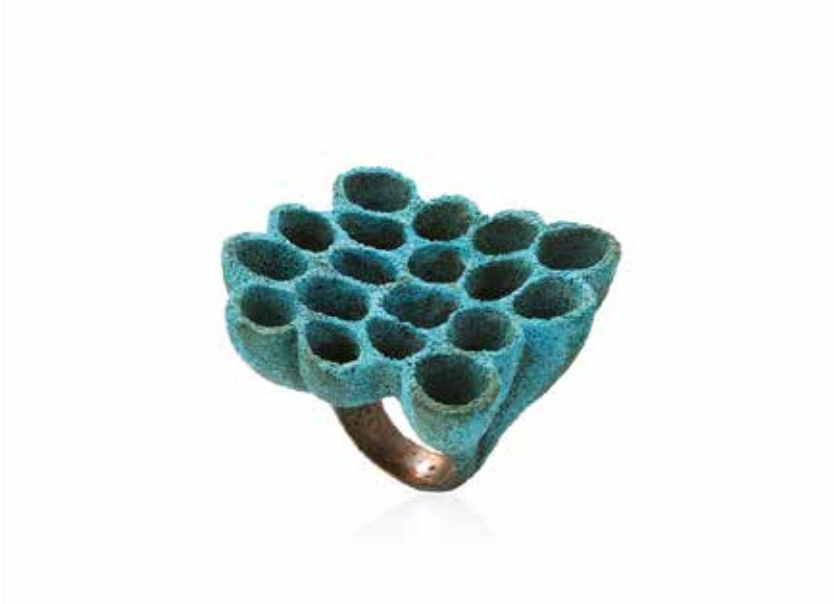
Lorenzo Pepe Ring: Bronzo Corallo , 2019 Bronze Photo by: Andrea Salpetre © By the author. Read Klimto2.net Copyright.