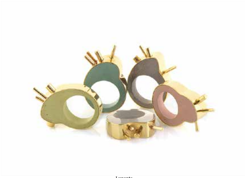
Lunante Ring: Cuori di Barbapapà , 2019 Gold plated brass, brass powders, polymer, pigments. Photo by: Andrea Salpetre © By the author. Read Klimto2.net Copyright.