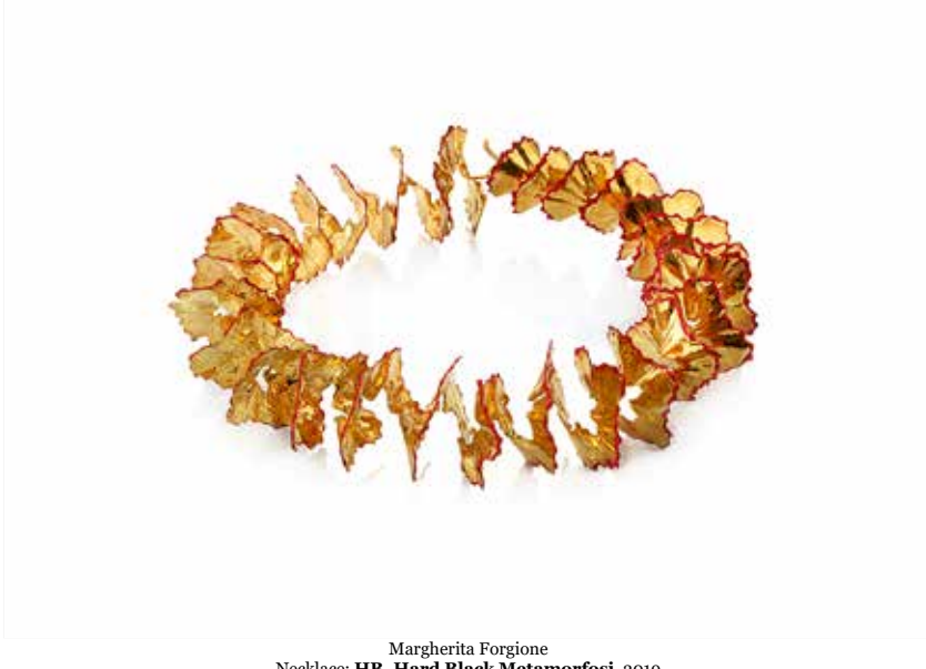
Margherita Forgione Necklace: H.B. Hard Black Metamorfosi , 2019 Wood, bronze bathed in gold enamel. Photo by: Andrea Salpetre © By the author. Read Klimto2.net Copyright.