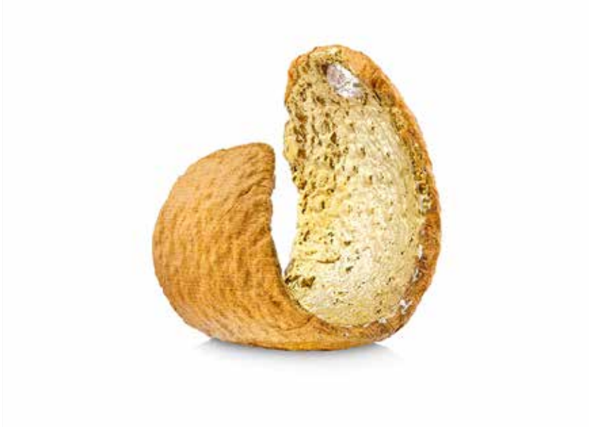
Tetyana Kalyuzhna Ring: OK , 2019 Silver, w.sapphire, gold plated and coated with orange latex. © By the author. Read Klimto2.net Copyright.