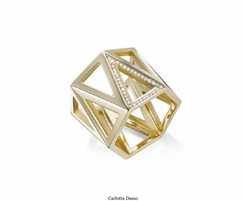
Carlotta Dasso Ring: D326 , 2019 18k gold, diamonds. Photo by: Andrea Salpetre © By the author. Read Klimto2.net Copyright.