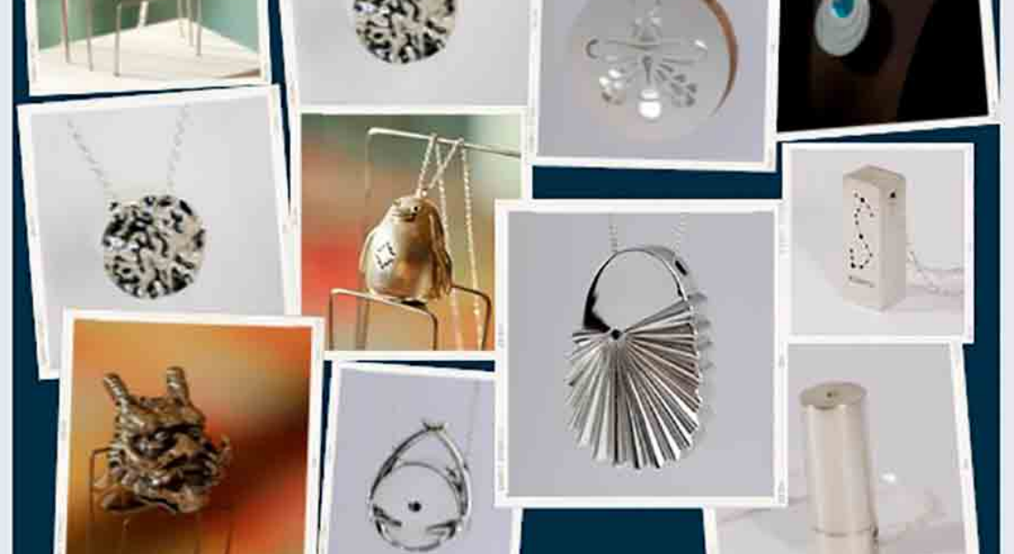
Some of the pieces exhibited in Milan, Italy.