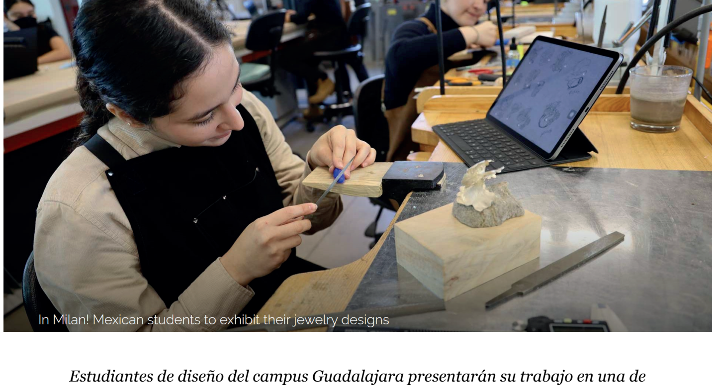
In Milan! Mexican students to exhibit their jewelry designs

Estudiantes de diseño del campus Guadalajara presentarán su trabajo en una de las exposiciones de joyería más grandes de Europa, en Italia