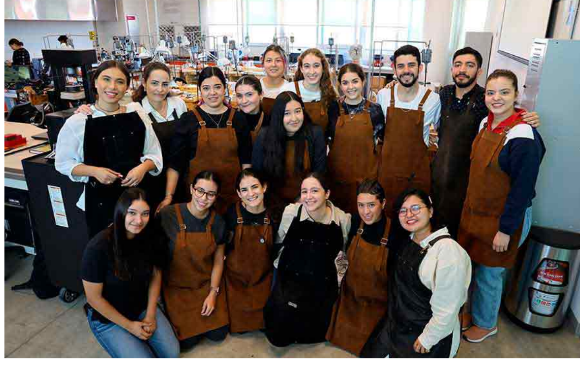
The group of students from the Guadalajara campus design jewelry workshop and two advisory professors will exhibit their pieces in Milan.