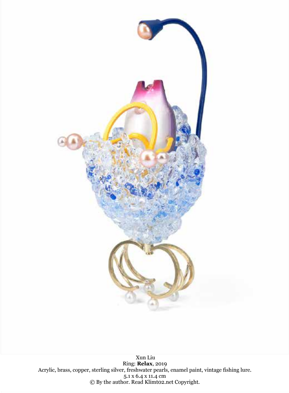
Artstar Jewels 2022, The Jewellery as never seen before.