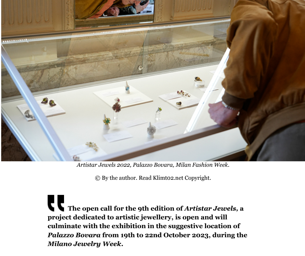
Artstar Jewels 2022, Palazzo Bovara, Milan Fashion Week.