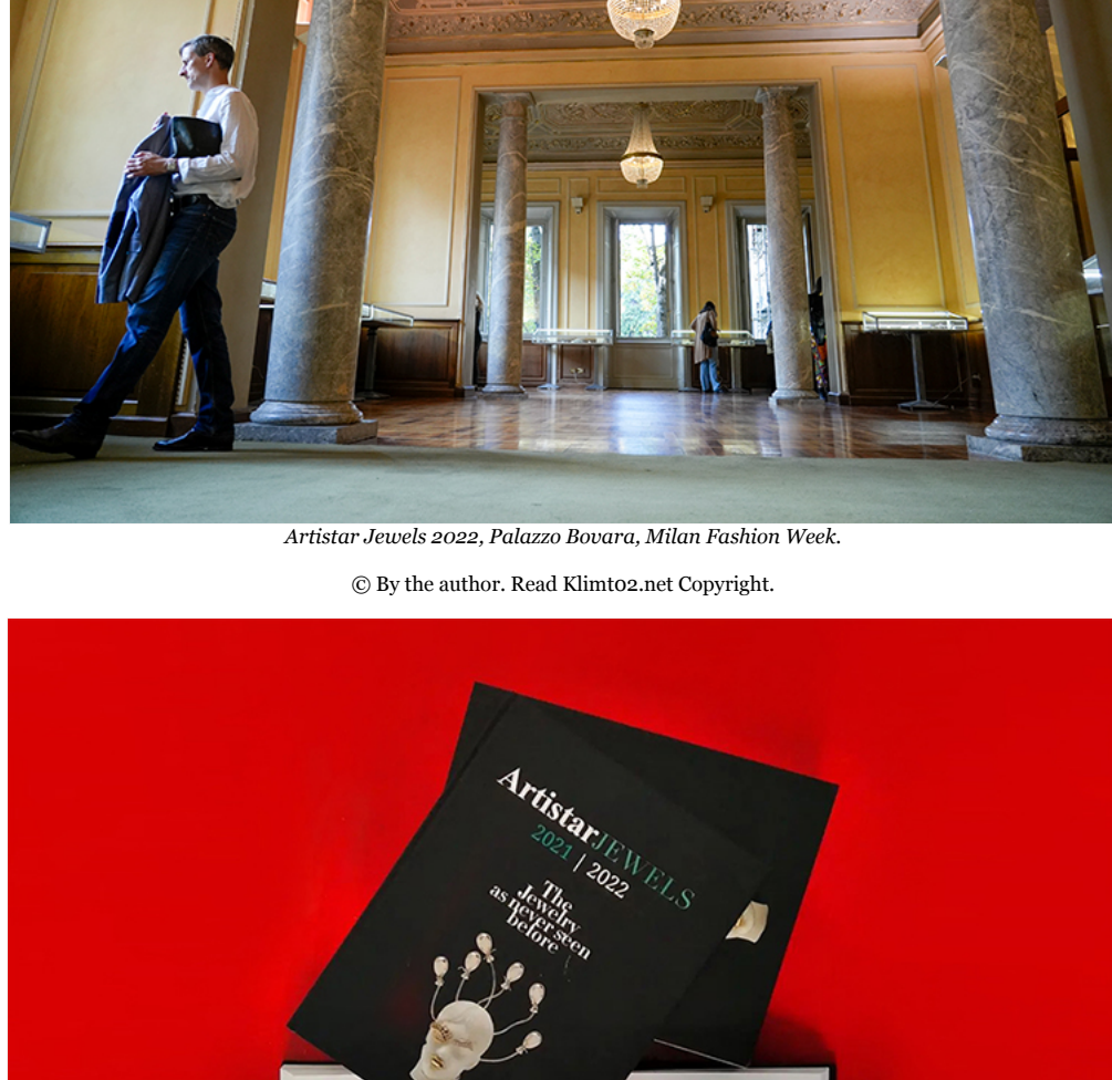
Artstar Jewels 2022, Palazzo Bovara, Milan Fashion Week.

For more information visit the website: www.artstarjewels.com .