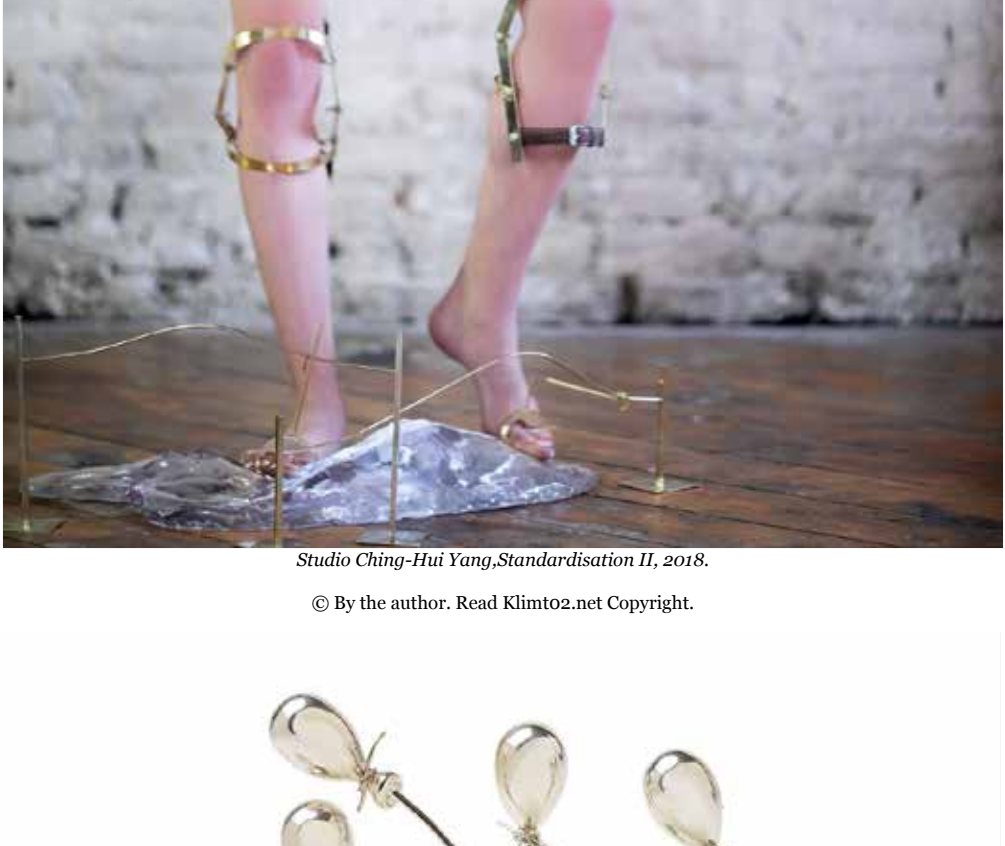
Melis Agabigum Brooch: Swoon , 2020