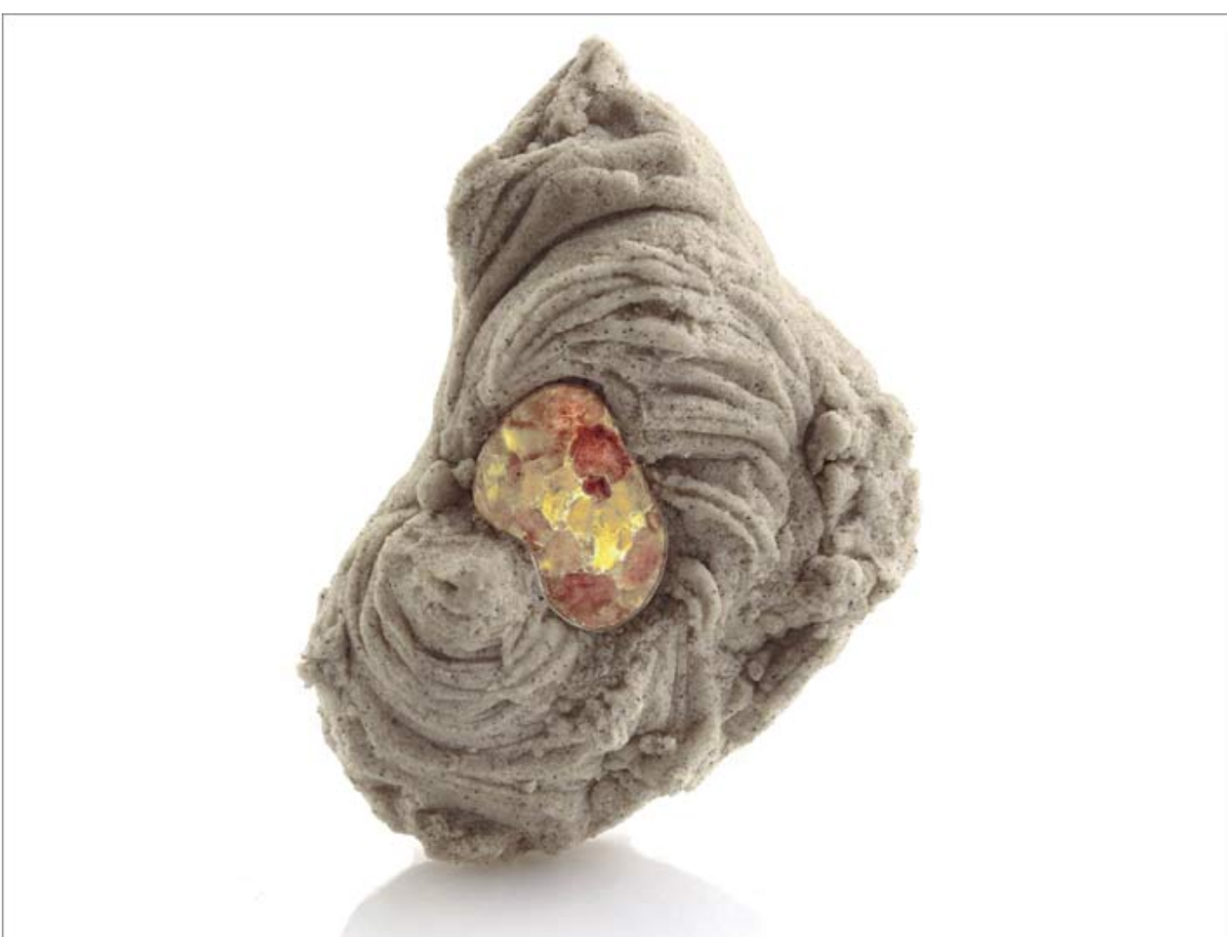
HANNA KOWALSKA, ALL COASTS BROOCH