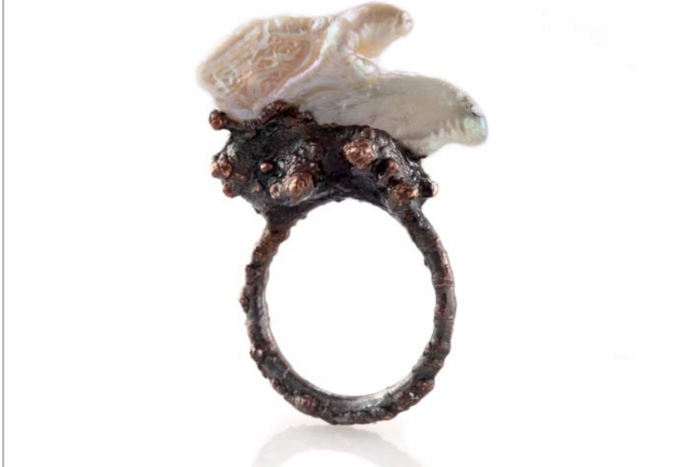
MARIA LOUISE HIGH, DOUBLE LUMINOUS RING

A jury selects the artists who have stood out for their originality and design. To participate in the selections for Artistar Jewels 2023 it is necessary to send your application by 20 February 2023 at the following link: www.artistarsewels.com/aj/form-application.html . The selection criteria include unique pieces or small series, jewels with a recognizable style and a strong communicative impact, creations made with traditional materials and/or reinterpreted in an original way or research jewels designed with innovative and/or recycled materials.