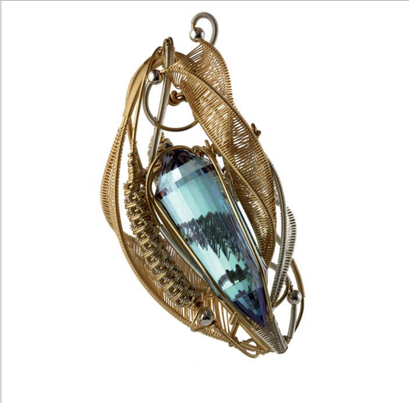
JOHN FARRIS, VISIONARY-ARTS VOGEL'S AQUA AURA DREAM BROOCH