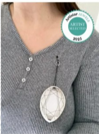
Upcycled Pear-cut Reimagined Gemstone (on model.) Upcycled fiber, digital drawing on recycled paper, plexiglass, black thread, sterling 925 hand-fabricated jump ring, safety pin.

Milano Jewelry Week will celebrate the culture of jewelry in its 11th edition next month in Milan, Italy. At least 380+ artists and jewelers from across the globe will have their jewelry creations on display at a beaming city-wide festival of different events and locations within Milano Centrale (city-center.) Artistar Jewels will present an international selection of jewelry, ranging from fine craftsmanship to conceptual design, including artistic and experimental pieces. My Upcycled Pear-cut Reimagined Gemstone falls into the contemporary jewelry *experimental* category as I like to employ unusual materials. I am thrilled to be invited to show this brooch alongside my Upcycled Reimagined Gemstone No. 2 . Both